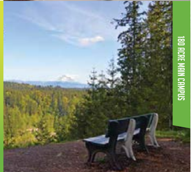
180 ACRE MAIN CAMPUS