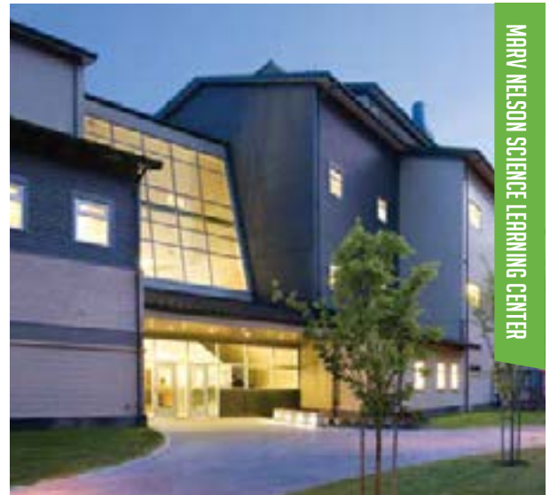
MARY NELSON SCIENCE LEARNING CENTER