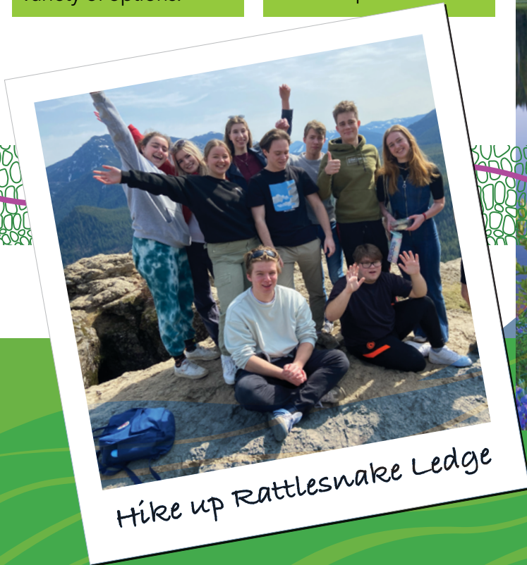
Hike up Rattlesnake Ledge